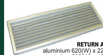
■ 350S RETURN AIR VENT aluminium 620(W) x 220mm(H) cutout size: 595(W) x 195mm(H) available in clear anodized and 16 powder coat colours (quantity restrictions apply)