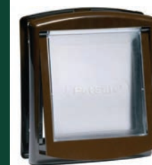
■ 346BRW medium flap size 228(W) x 267mm(H) dog shoulder height 425mm