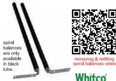
spiral balances are only available in black tube.