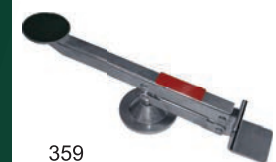
359 door lifter allows hands free adjustment of door height when fitting hinges