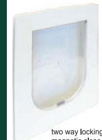
two way locking magnetic close