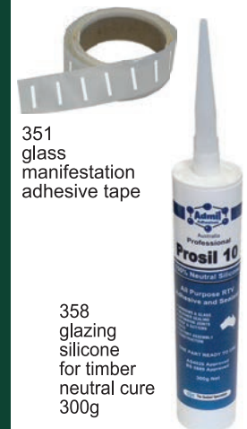
351 glass manifestation adhesive tape