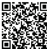
removing & refitting spiral balances video