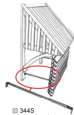
□ 344S window hood privacy screen strut stainless steel 425mm