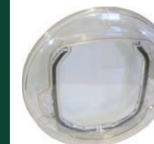
■ 347BRW large flap size 305(W) x 356mm(H) dog shoulder height 515mm